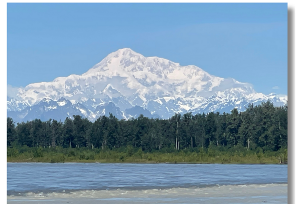
Mt. Denali in Alaska